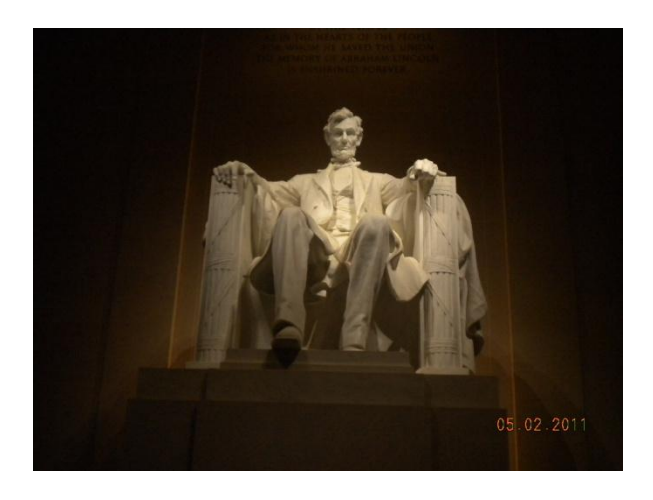
The Lincoln Memorial