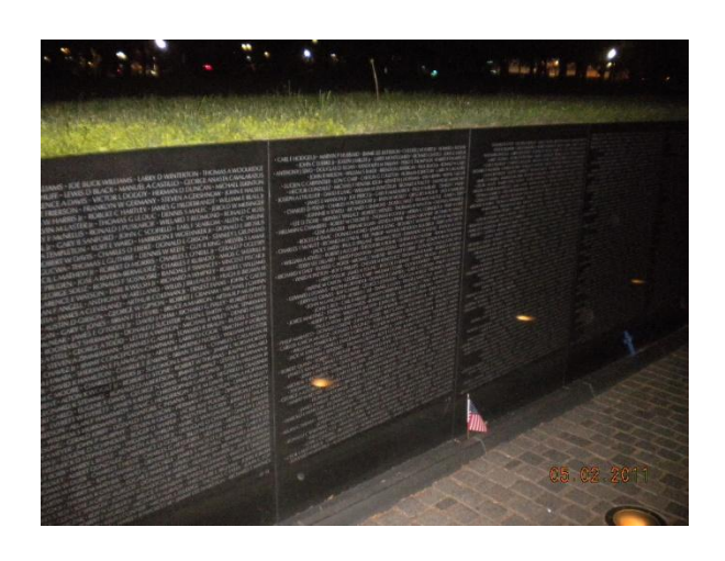
The Vietnam Memorial