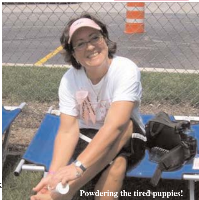
Powdering the tired puppies!

“It's raining this morning. One of those nice, gentle rains that sinks into the soil and nourishes both the flowers I have planted and the vegetable seeds sprouting in the garden. I am grateful for this rain, but I am equally grateful it didn't rain Saturday or Sunday while my friend Beth and I were walking downtown Chicago in the Avon Walk for Breast Cancer.