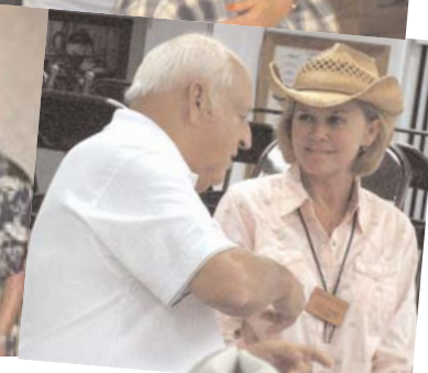
Royale Coach Club Rally First Timers