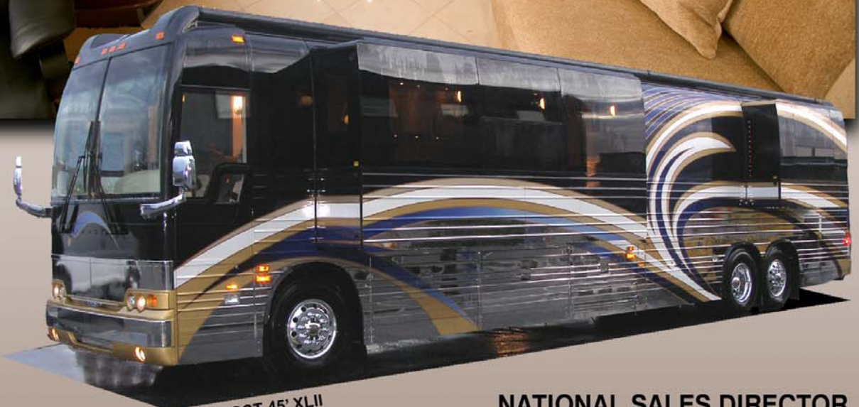
PREVOST 45' XLII Double slide

Visit us on the web at www.legendary-coach.com and see all of our Luxury Conversions