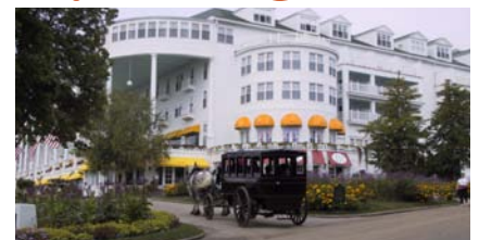
Grand Hotel - Mackinaw Island

The Michigan country side is great for sightseeing, motorcycle riding, golf & spa, wine tours and gambling is available 2 miles from campground.