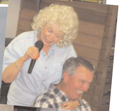
Royale Coach Club Rally First Timers