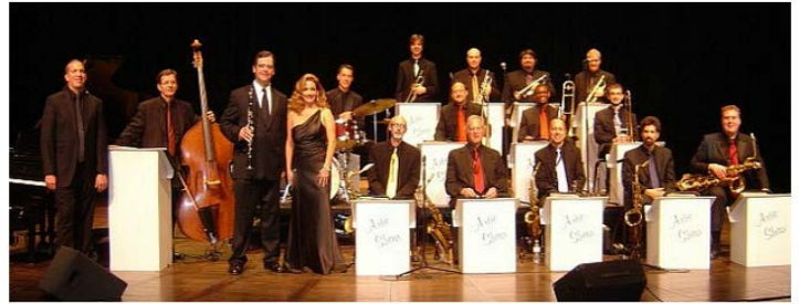
Artie Shaw Orchestra

*Same day as our lunch at Lazy Days in Islamorada.